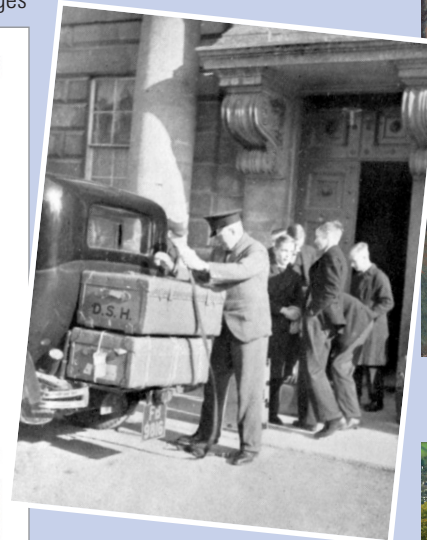
Above: Going home.

Right: An aerial view of the central campus showing the setting of the Bury Sports Centre and the 1st XI Cricket Oval.