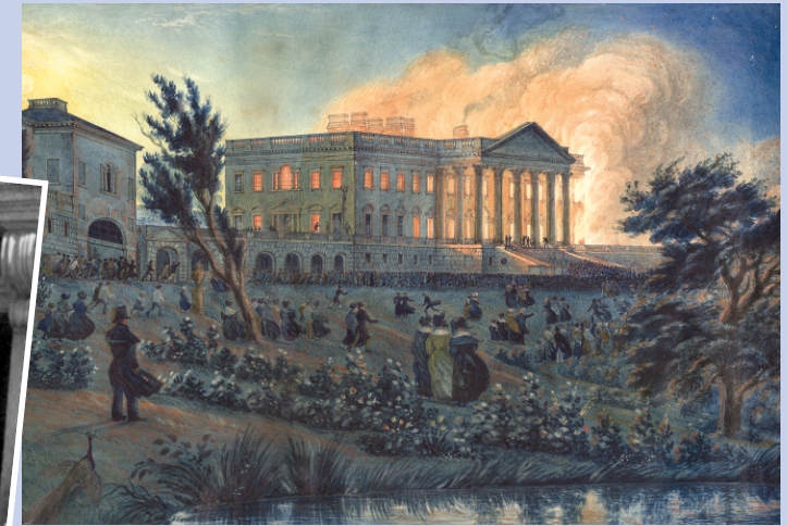
The fire of 1836 from a picture at Prior Park.